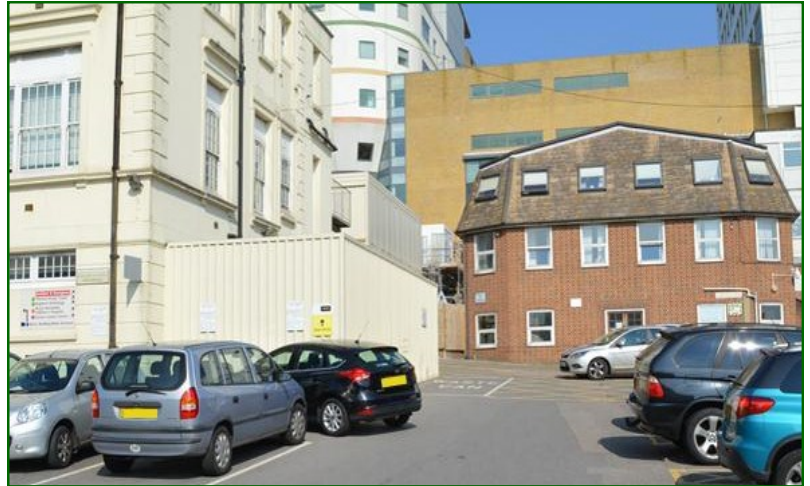
The route to the crossing from the front of the site.

This change will not affect the Multi-storey car park. It is reached by another route (marked as North Road on the map overleaf).