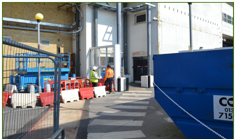
The crossing that will be closed.

Redevelopment nuggets: The main entrance to the hospital is in the Barry Building. This is the oldest inpatient ward building in the country. It took its first patient 20 years before Florence Nightingale started nursing. The Barry Building will be replaced by the second of the redevelopment's new buildings due to open in 2023.