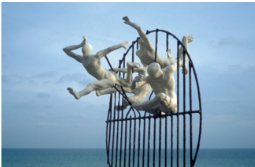
Flight of the Langoustine (Maquette 2), by Pierre Diamantopoulos, the planned second sculpture for Hove Plinth

failed to make an impression and look distinctly uncared for. Given Brighton's reputation for cutting-edge originality and creativity, we could and should have done better than this. I can think of, at most, only three modern sculptures that have had a significant impact: the "Doughnut" on the Albion groyne, the "Kiss Wall" close by and, most notably, the beautiful "Constellation" on the Hove Plinth. (More than 600 images of "Constellation" have been posted on Instagram, and the next occupant of the plinth, "Flight of the Langoustine", a tremendous, dramatic piece, looks a worthy successor.) And sometimes, out of the blue, less orthodox works like the Martlets Snow Dogs bring a joyous sense of fun wherever they turn up.